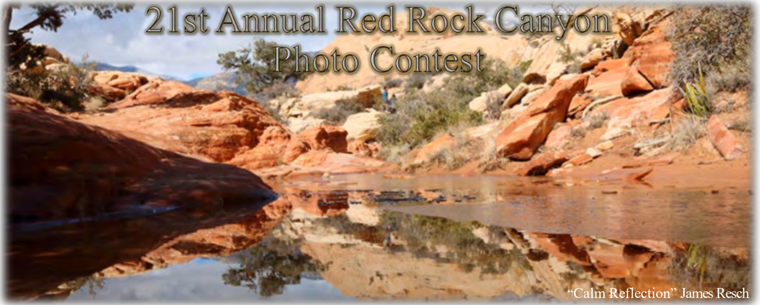
“Calm Reflection” James Resch

Please see reverse for complete entry rules.